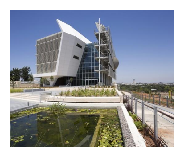
PORTER SCHOOL OF ENVIRONMENTAL STUDIES' NEW CAPSULE BUILDING

TAU's support for sustainable projects on campus is further underscored by the Porter School of Environmental Studies' new Capsule Building. The Capsule Building has received LEED Platinum Certification – the highest accreditation of the LEED certification system, developed by the US Green Building Council.