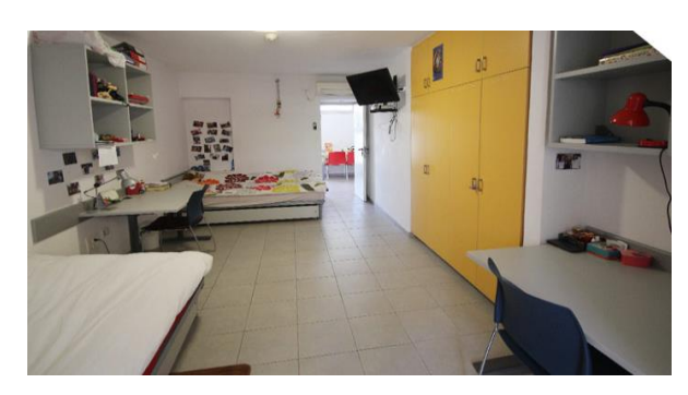
Inside an Einstein dorm room

Prices are 600 USD per month for a shared room, utilities and municipal tax included. The shared areas will be cleaned on a weekly basis. Students who are living in the dorms are expected to sign a contract and pay in advance.