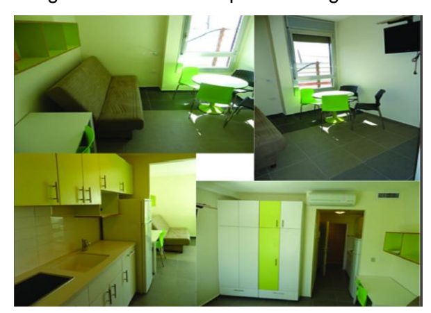
Inside the Broshim studio rooms

Fees: 800 USD per month for a studio apartment utilities and municipality tax included. Students who are living in the dorms are expected to sign a contract and pay in advance.